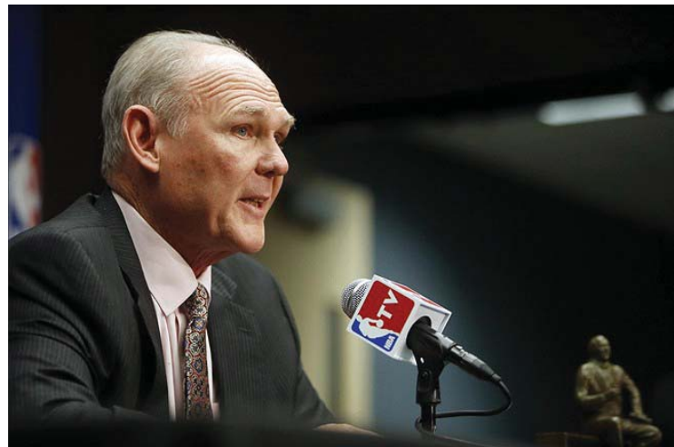
Gost BCB 2013: Džordž Karl / Guest 2013: George Karl

Izvesno je: svi naši treneri, ali i gosti iz inostranstva, dobiće izvanrednu priliku da se edukuju na ovoj Beogradskoj košarkaškoj klinici Beograd 2013. Ona je za domaće uslov za overavanje licenci za sezonu 2013-14. ukoliko vode seniorske ekipe. Seminaru mogu priusu-